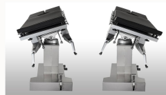
Lateral tilt (left/right)